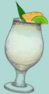
TROPICAL MARGARITA | $12

Four Roses Bourbon, Lemon, Honey, Passion Fruit, Egg White