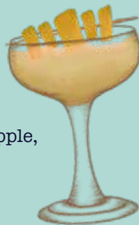
SMOKING RITA | $13

Tequila, Banana Liqueur, Pineapple, Coconut, Lime