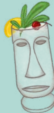
COCONUT COYE | $12

Pineapple Vodka, Coconut Water, Sweet + Sour