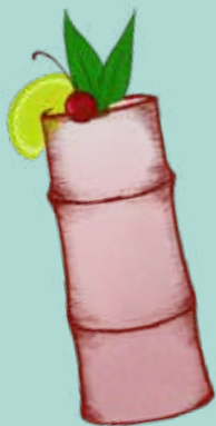
FLAMINGO | $12

Pineapple Vodka, Coconut Water, Sweet + Sour