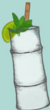
MOJITO | $12

Hamilton White Stache, Lychee, Lime, Rose