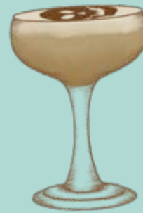
PORT LIGHT | $13

Four Roses Bourbon, Lemon, Honey, Passion Fruit, Egg White