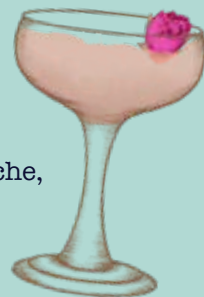
TREASURE BOX | $12

Don Q Cristal, Dark rum, Coco, Orange, Pineapple, Grenadine