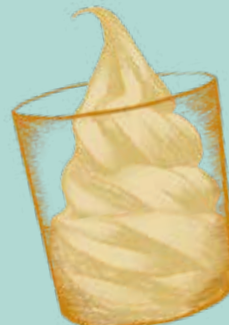
DOLE WHIP | $13

Blended Dole Pineapple with Mt. Gay Eclipse - 'Nuff said