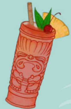
BAHAMA MAMA | $12

Don Q Cristal, Dark rum, Coco, Orange, Pineapple, Grenadine